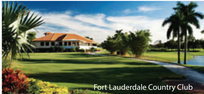
Fort Lauderdale Country Club